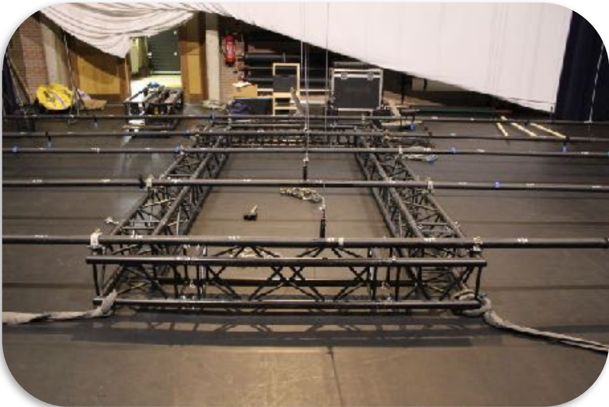
OPTION 1: The truss frame, directly attached to the fly system of the theatre.